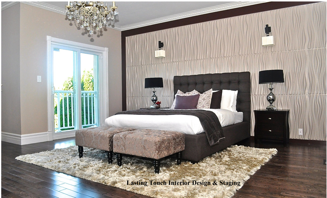
Lasting Touch Interior Design & Staging