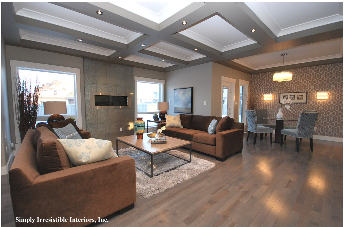
Simply Irresistible Interiors, Inc.