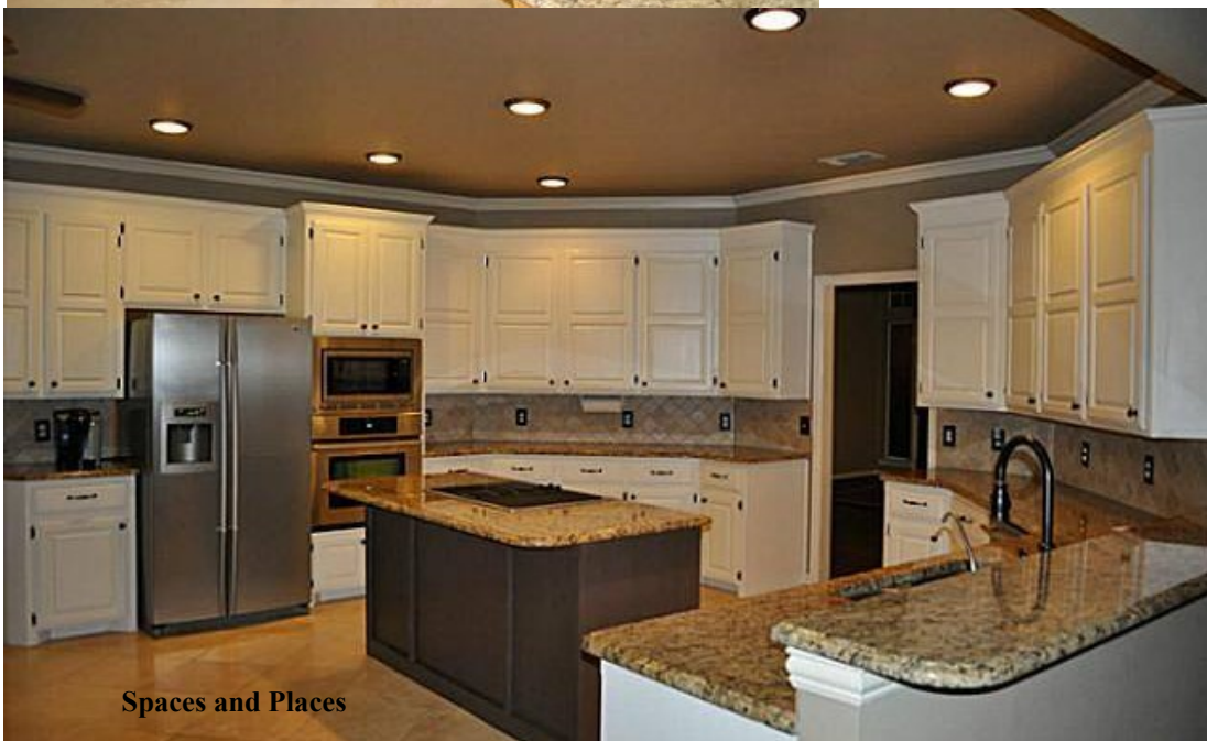
Spaces and Places

Sherwin Williams is a proud sponsor of RESA®