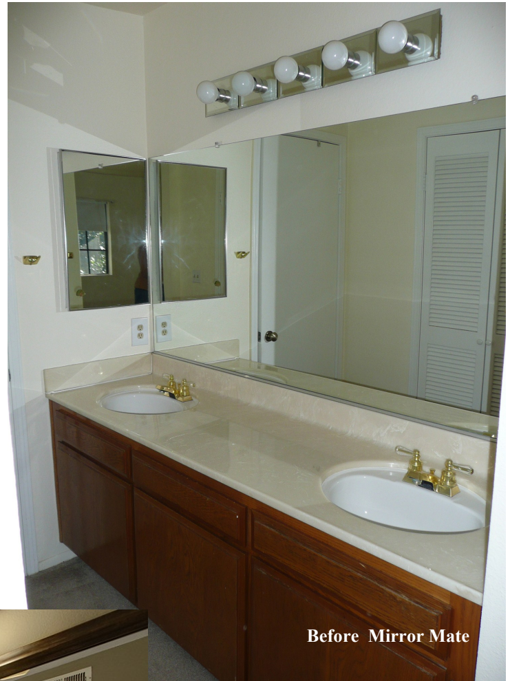
Before Mirror Mate