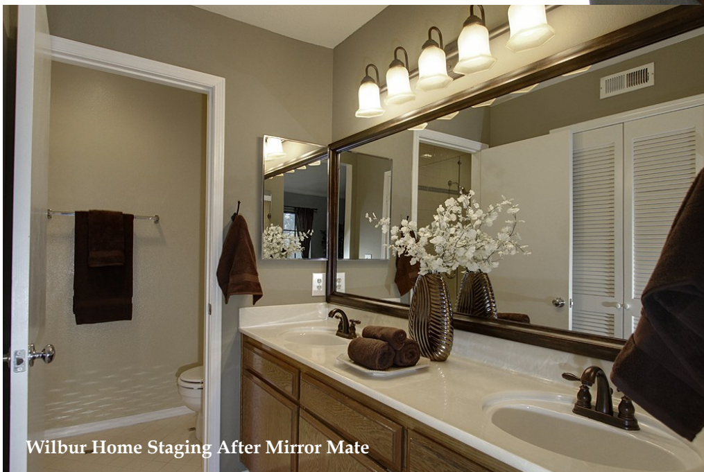
Wilbur Home Staging After Mirror Mate